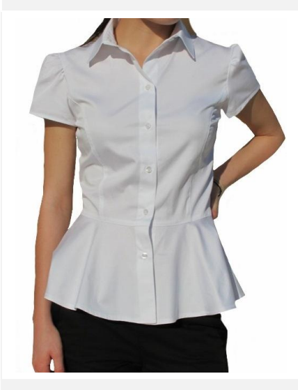
"Peplum Blouse" PRICE £32

"the new generation of uniforms for yacht crew"