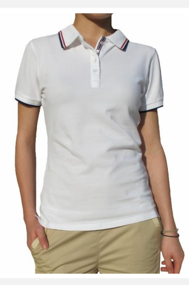
"Nautical Polo" PRICE £16

2.elegance and sophistication 3. A way of expressing something that is characteristic to a person or a group of people