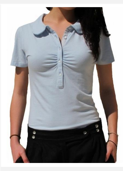
"Girly Polo" PRICE £16

Classic polo in a Nautical style. Constructed in super soft Cotton & Elastan piqué. Featuring twin tipped collar & cuffs, nautical tape on the placket & side slits. Nice, fitted look. This polo has a matching style for the boys. Looks great with red, navy, grey or black shorts.