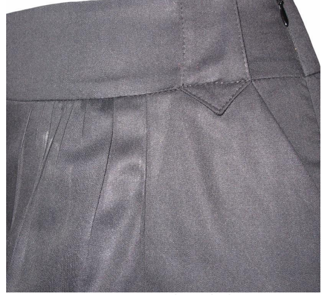
Light draping detail, belt loops and side pockets.

Front Vent Discretely Hidden behind an overlap.