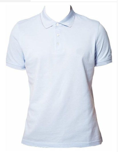
"Minimal Polo" PRICE £18

This polo is a match to the Girly Polo. Constructed in super soft Cotton & Elastan piqué In pale blue with grey oxford trimmings. This polo has a very nice cut and modern, fitted look. The sizes run big, so we recommend purchasing size smaller to the regular.