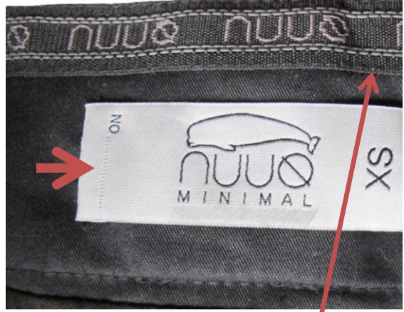
Branded tape with grippers . These grey rubber strips will help keeping your shirt tucked in. Also, be glad to know, that all labels have a special spot for you to write your NO on.